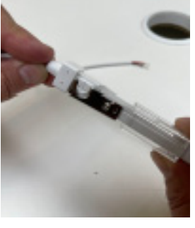
Press together until clipped in securely.