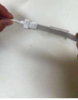
Place the metal prongs between the copper and the LED.