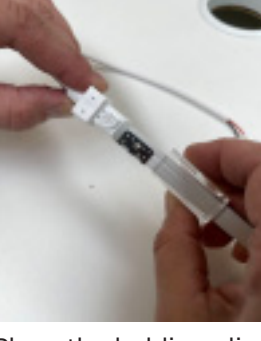
Place the holding clip in line with the silicone. (The end with the clip facing outwards)