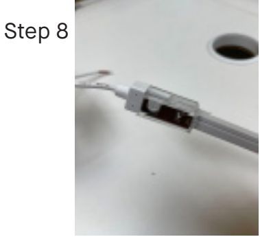
Complete the seal by sliding the clear end cap back until clipped in place.